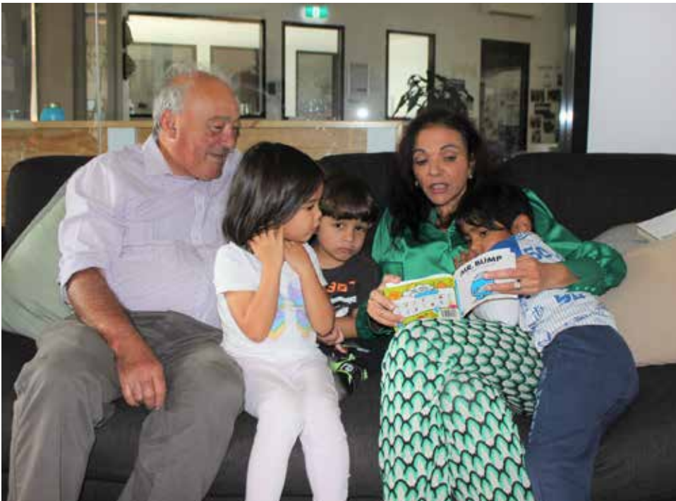
Who doesn't love story time? Minister Aly and I gained a few friends during our visit to Macarthur early education centres.

Our fantastic Minister for Early Education, Anne Aly MP, visited Macarthur recently and we met with the staff and children of Goodstart Early Learning in Willowdale.