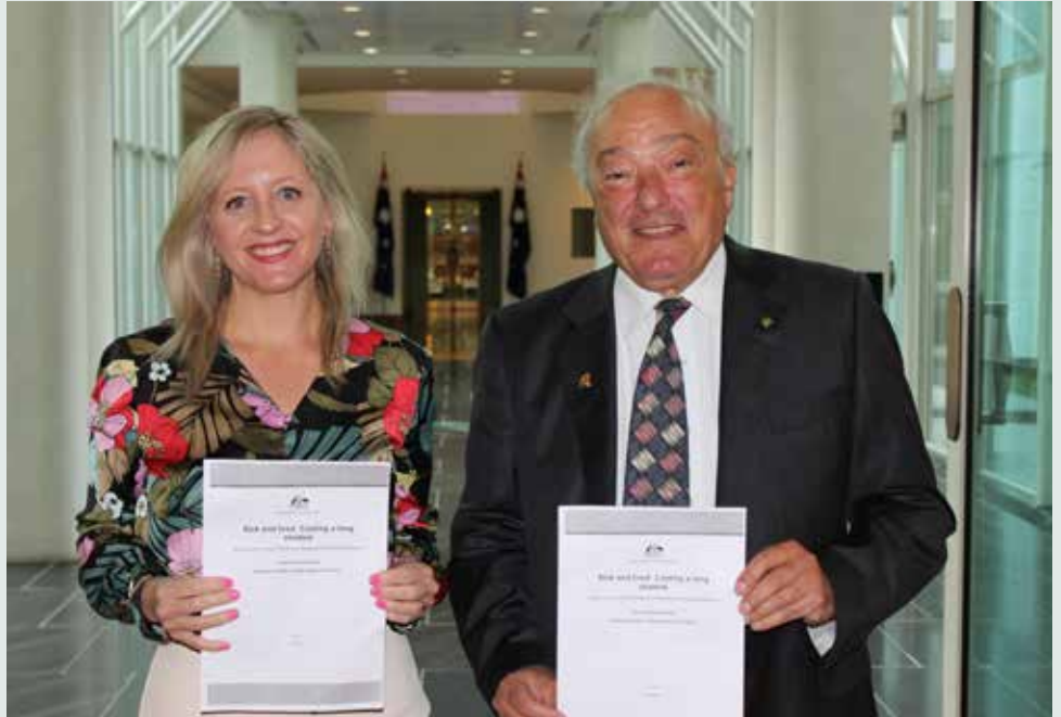
Ms Melissa McIntosh MP and I presented our Long COVID Inquiry to the Federal Parliament recently.

I am thankful also to the Minister for Health and Aged Care, the Hon. Mark Butler MP, for his support, interest, and guidance