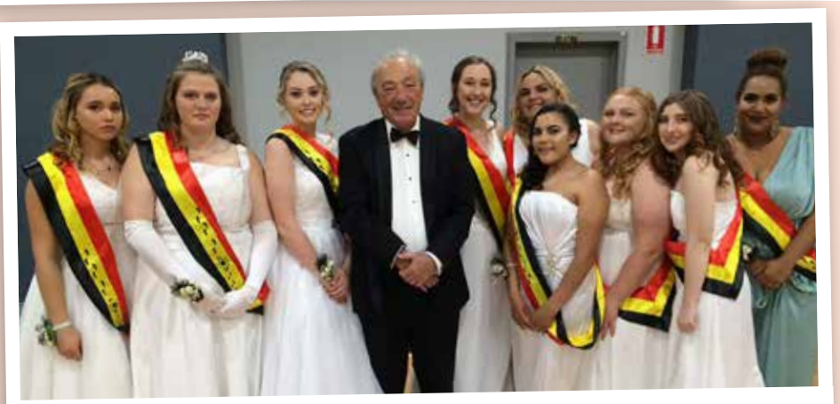
2016 Macquarie Fields and Campbelltown Police Aboriginal Debutante Ball.

to see if I could learn a few tips for myself.