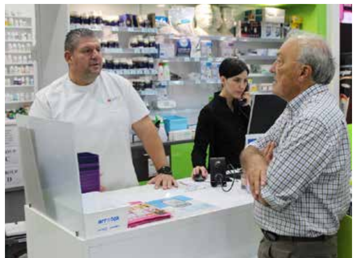
Pharmacies, such as Priceline Pharmacy in Oran Park, provide crucial healthcare services. Our Cheaper Medicines policy helps ensure patients can better afford their prescriptions.

Our changes mean more people can afford to get the medications they need to stay healthy - without worrying so much about the price.