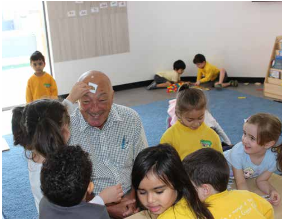
Early education is such an important part of our community and thanks to our fee-free TAFE & VET policy, we are helping deliver more quality educators.