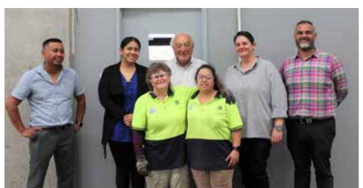
Meeting the wonderful team at Hoxton Industries at their Return & Earn facility in Minto.