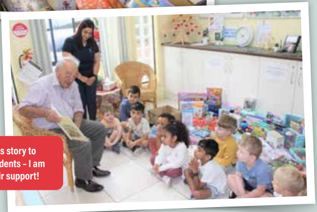
Reading a Christmas story to Pelican Preschool students - I am very grateful for their support!